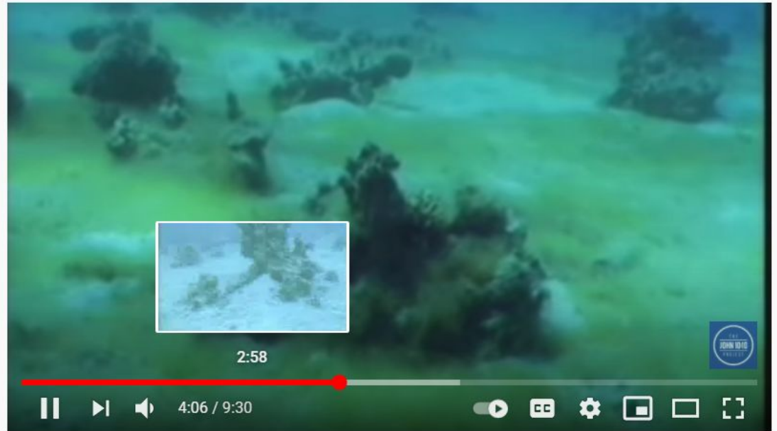
THE EXODUS EXPLORED—Chariots and Coral