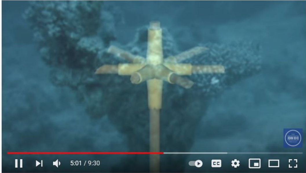
THE EXODUS EXPLORED—Chariots and Coral